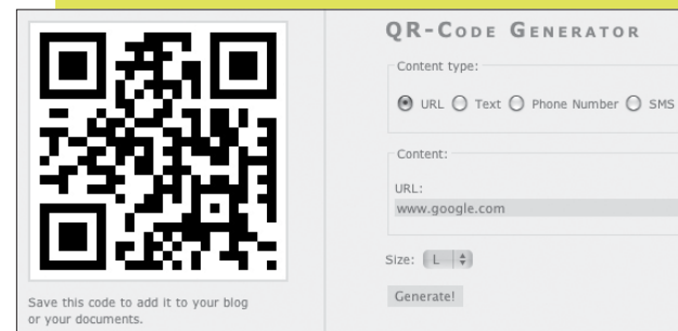
An example of a QR code generated for a link to Google on Kaywa QR-Code Generator.

To create the most basic codes, you simply go to the site, input the URL to which you would like the code to point, and hit "generate code." You'll get back a .png or .jpg image that you can save and insert into your print or online materials.