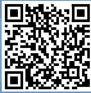
ASTRO-DYNAMIC SOLAR PAGE